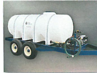
Supply Trailers and Trucks