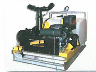
Low Volume Mister