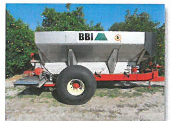
BBI Fertilizer Spreaders