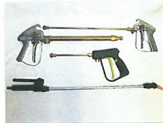
Spray Guns and Wands