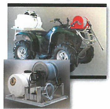
Standard Designed 15, 35 and 55 Gallon Skid mounted 12 Volt Sprayers for ATV and UTV