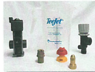
Spraying Tips, Valves and Accessories