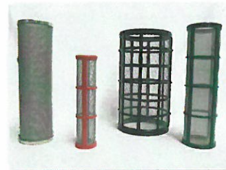
Stainers, Baskets and Filters