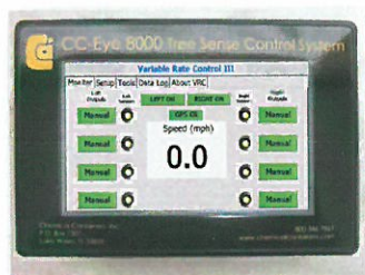
CC-Eye 8000 Tree Sense Control System