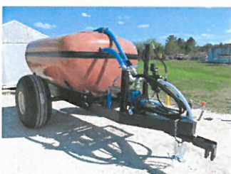
Classic Design Fiberglass Tanks