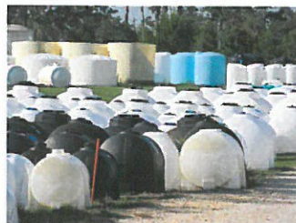
Poly Storage Tanks