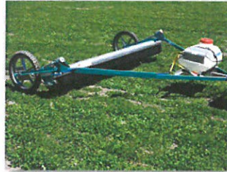
Sprayless Weed Wiper Applicators