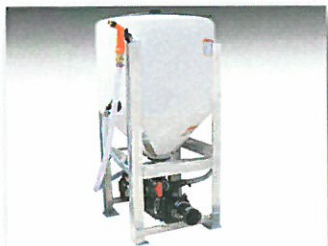
Chemical Inductor Unit

This is only a partial list of what we manufacture and inventory