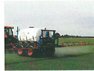
Turf and Pasture Sprayer