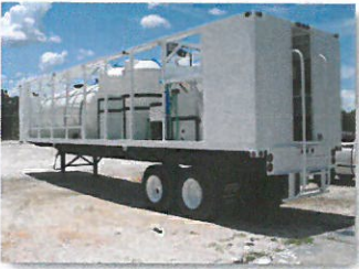
Portable Mix Stations