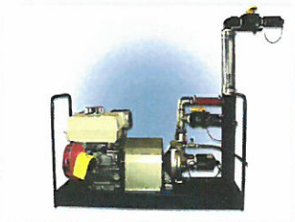
Portable Injection Skids