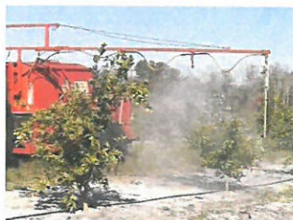
Hoop Boom Sprayers