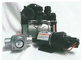
Pumps - 12V, Air Drive and Electric