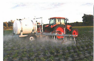
Strawberry & Row Crop Sprayers