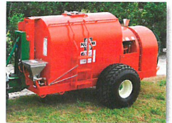
Rear Sprayers in many sizes and configurations