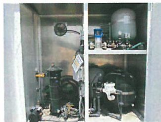
Water Recycling System