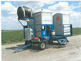
Food Safety Equipment