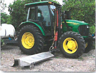
Front Mount and Mid Mount Herbicide Booms Available

Increase Production - Decrease Manhours With The Right Equipment. Complete In-Stock Line Or We Will Build To Your Specifications.