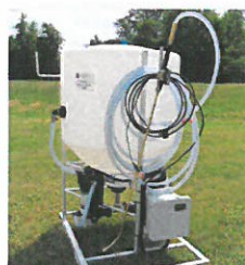
Portable Dosing Skids